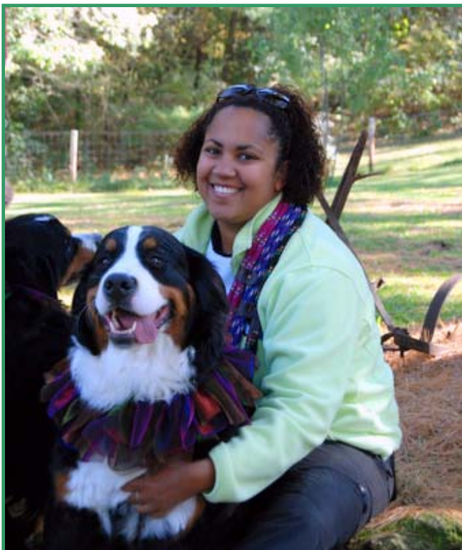
CLUB FUN DAY IN SPRING VALLEY, WI

I hope that you all find many ways to enjoy your Berners this winter and I hope to see you at our club events this winter. Enjoy the snow – it is coming!●