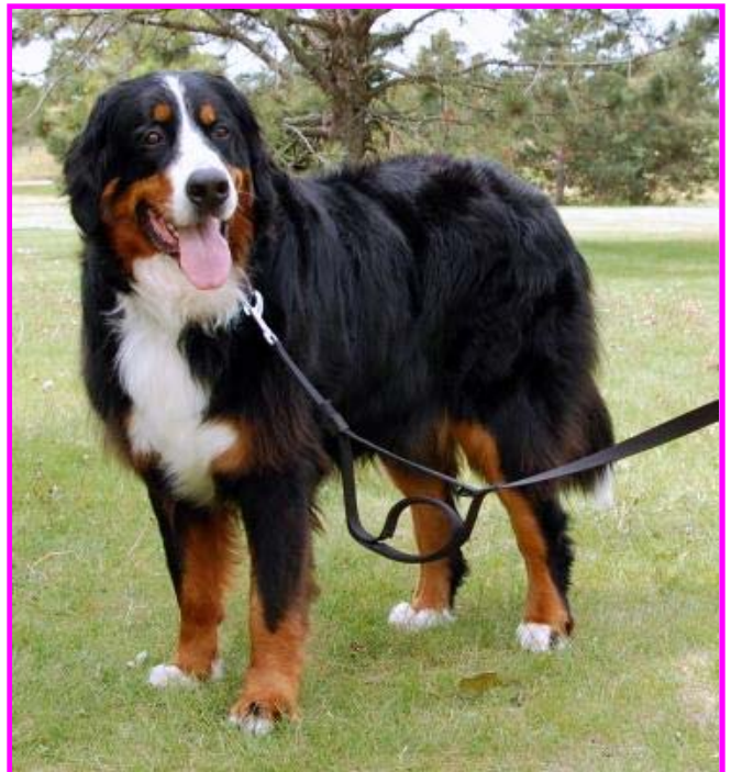
A thinner, happier Bella just a few months after being rehomed. When Bella first entered the Rescue and Rehome Program, she was so heavy she limped.

In addition to our own rescues, we also help to find homes for other Berners in the region held by other rescue organizations. This month we're helping Bear, a purebred Bernese in Wisconsin. Bear had a troubled past fraught with dominance issues but has spent the last few months in rehab. Hopefully, he is a changed dog, relaxed and hump-free. Because we maintain so many active applications to adopt we are able to identify people that not only want to adopt a Berner but also can fulfill Bear's unique needs. If Bear does find a home, this month we'll have three placements for October. Good numbers but we can always do more!●