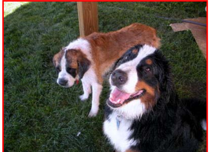
Barry the Bernese Mountain Dog became a big brother to Anya. He taught her to play, set the good example in training and brought out the fun-loving dog she is.

After Anya, I became a Placement Coordinator for MARS. As a foster parent, I just took care of the dog until I got a call saying it was going to be adopted. Now I screen applicants and decide who gets to adopt.