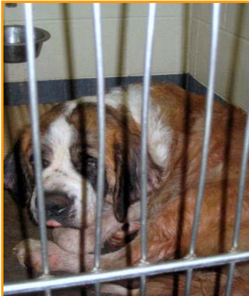
Anya the day she was discovered by MARS in an Indiana shelter.

We quickly realized that our Berner, Barry, was the biggest influence in Anya's rehabilitation. While we gave Anya a daily cocktail of pills, drops and dietary supplements Barry taught her to romp, play and be a dog again.