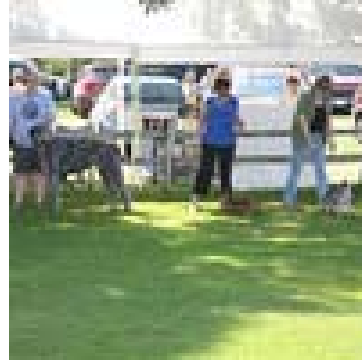
Quite the diversity in sizes in the Hound group!

shared their lives with and miss. There was also plenty of opportunity to provide info to people who came with their Berner, but weren't aware of the local club and wide array of activities we offer Berner owners!