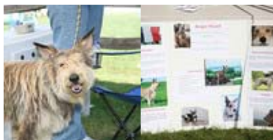
Rare breed, Berger Picard and info board about the breed