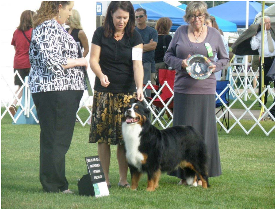
Stonehill's Bright Mesaverde