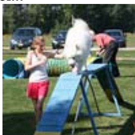
Agility practice for handlers of all-ages