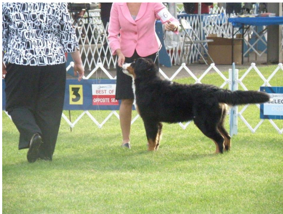
Snowbound's Moonlight Basin